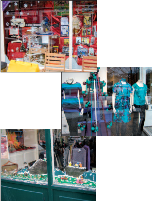
Shop windows top to bottom: RW Morten, Jackpot & Cottonfield, St Gemma's Hospice.

Thanks also to those retailers who didn't take part in the competition but whose shop window displays added to the town's festive appearance over the Christmas period.